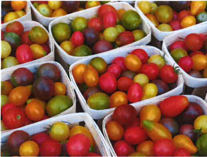
Green, red, orange, yellow and black tomatoes

If you ever get bored of red tomatoes, hop over to France and try every colour you can imagine!