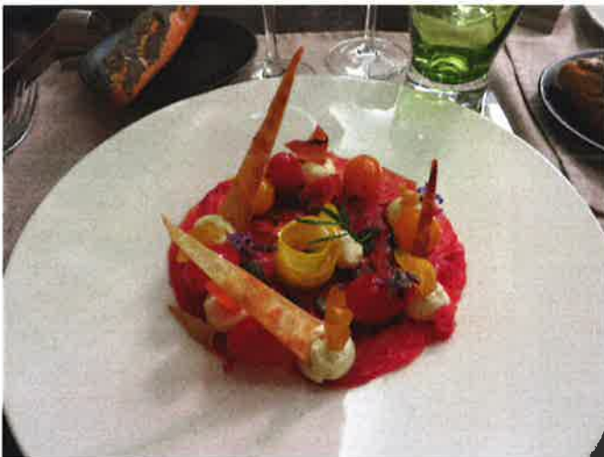
Beef with veal, three types of tomatoes and garlic flowers

An acquired taste but a favourite for many, pick up some olives as you wander around the stalls.