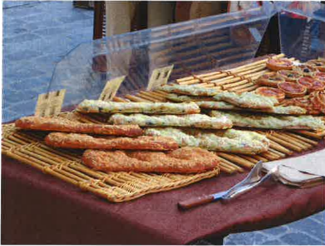
Bread topped with cheese

Two of our favourite French foods, get some bread and cheese to accompany your lunch.