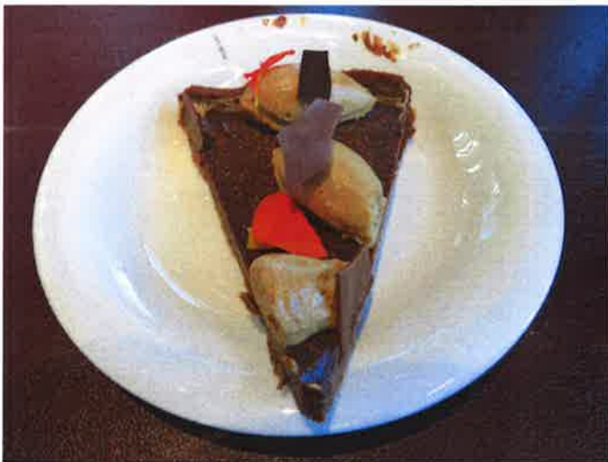
Chocolate and praline tart

Because why have a macaroon when you can have a macalon?