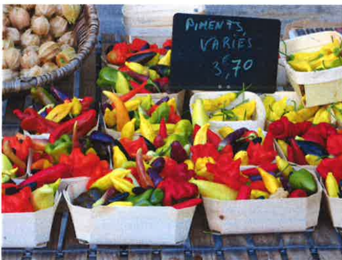
Variety of peppers