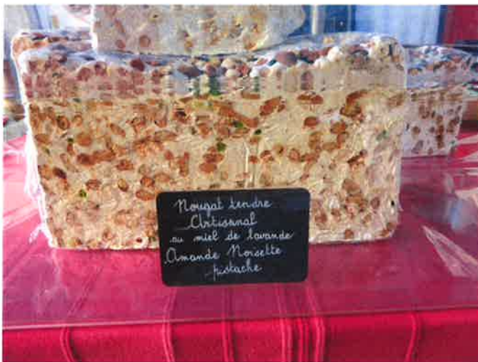
Nougat with almonds, hazelnuts and pistachios

Hake from the coast of Saint-Jean-de-Luz with a fennel vinaigrette courtesy of Cafe Bras in Rodez.