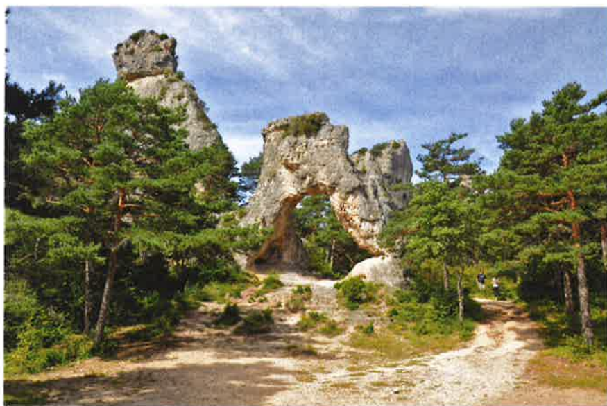
Striking rock formations of the Grands Causses