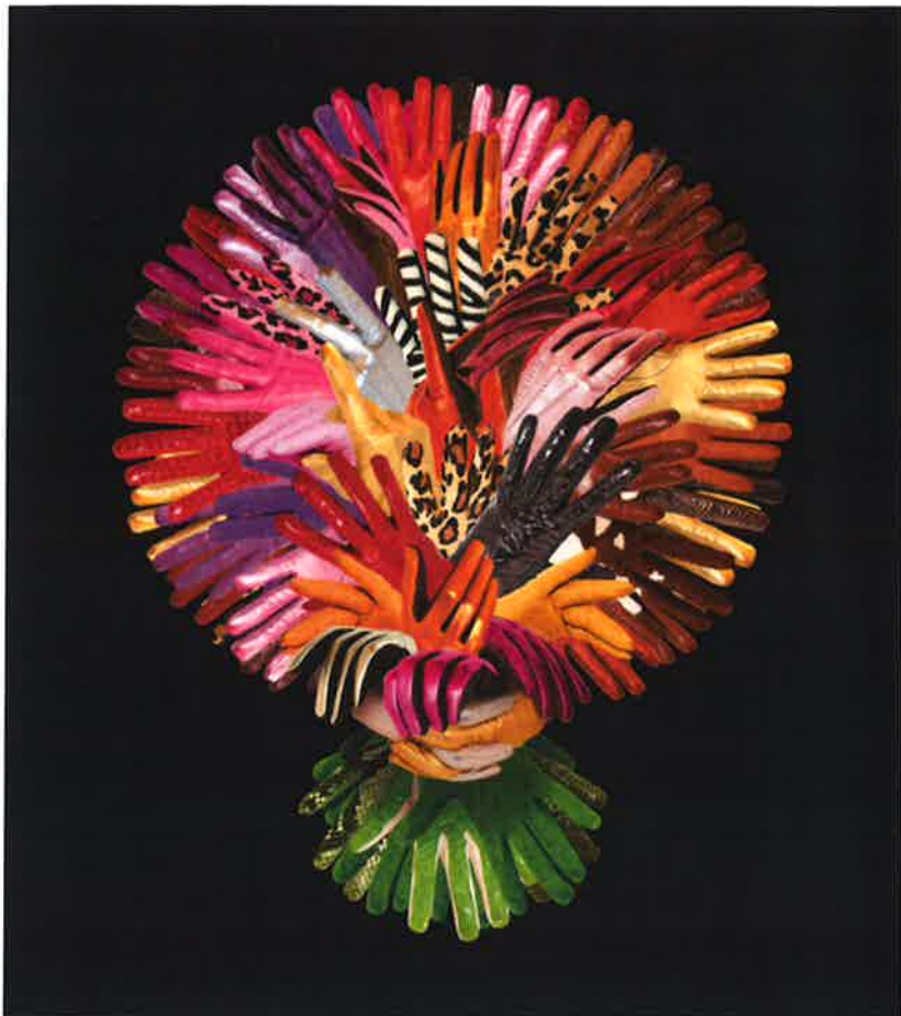
Millau's luxury glove industry has some celebrity fans