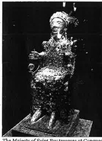
The Majesty of Saint Foy treasure at Conques Abbey