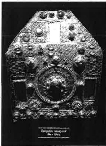
One of the Conques Abbey treasures