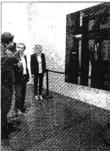
One of Pierre Soulages' paintings on display